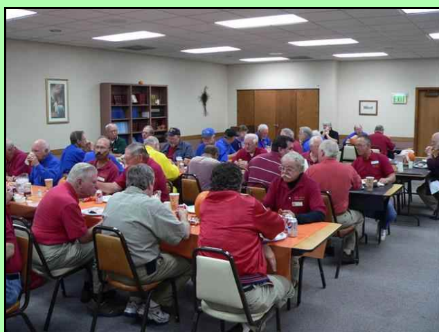
Taking lunch together