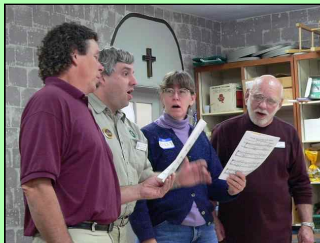
Directors Pickup Quartet