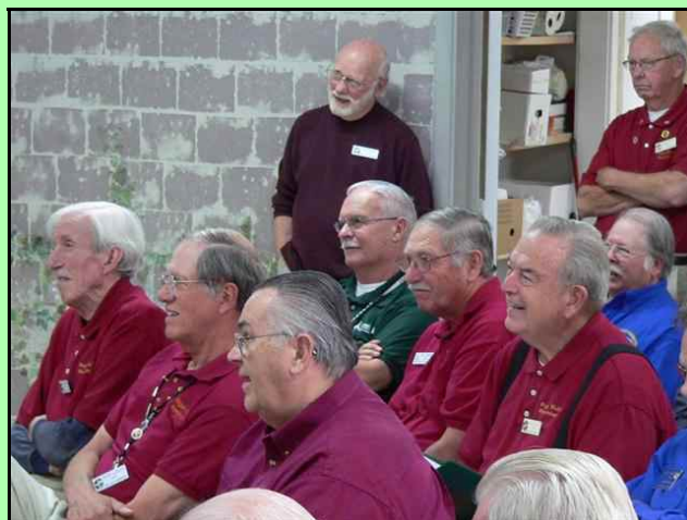
They like it! They liked it!

The workshop agenda enabled the participants to work together in section rehearsals, to sing as a combined chorus singing the two songs that they learned for this event, and to sing in different quartet combinations. But the biggest thrill for most of us was the chance to sing with a much larger chorus than we do on a weekly basis. With a major membership push, as with the reintroduced Professor Harold Hill membership drive, it could happen for us in our chapters.