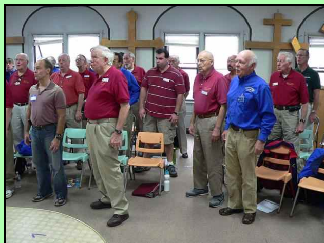
Keep The Whole World Singing . . . until we meet again, next year!