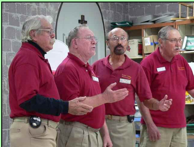
Spare Parts does its thing