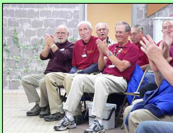
Lots of laughs and smiles!