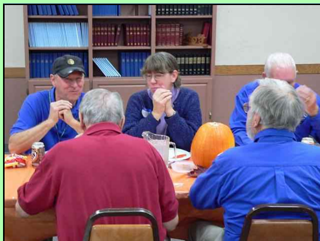
Bend Asst. Director and Director