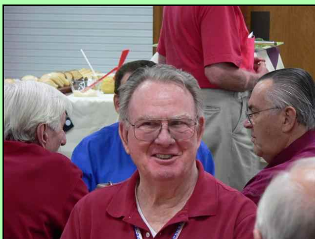
Photographer (Burt) gets his picture taken